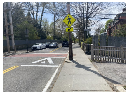
Walnut Street drop off zone at Walnut Path (OLS)