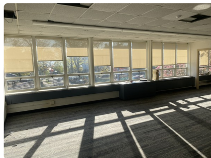
Fisher Hill classroom